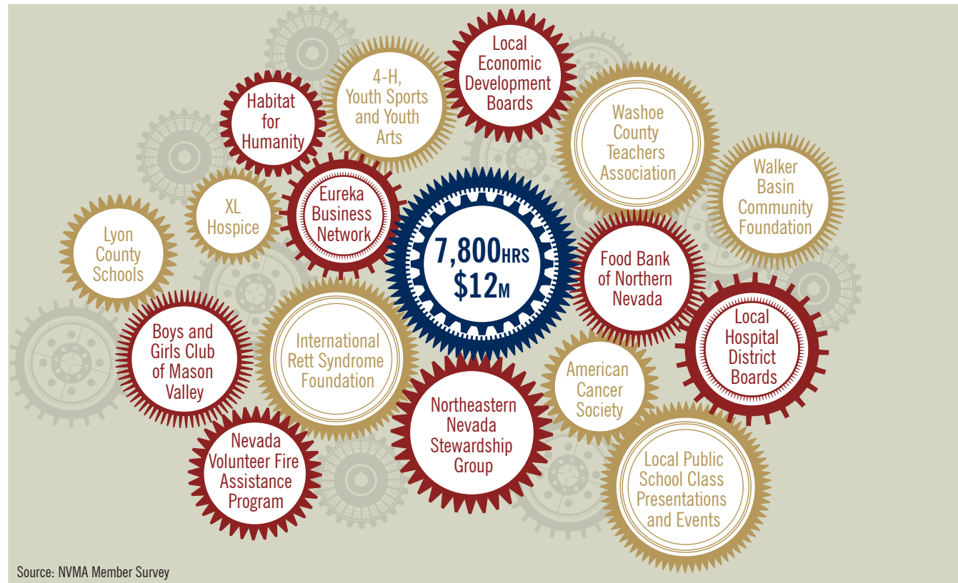
Source: NVMA Member Survey