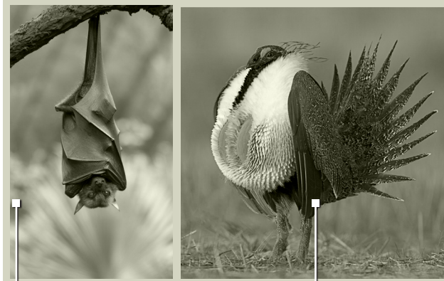
BAT HABITAT RESTORATION